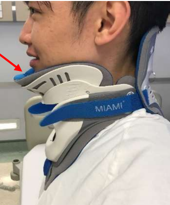
Collar too loose: