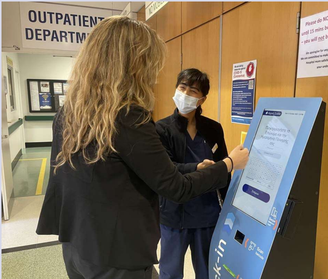
Self-service kiosk at the Outpatients Department