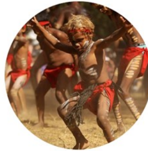
Connection to Country through Song