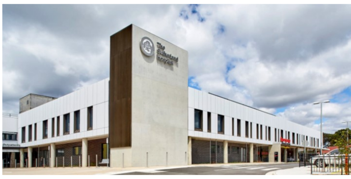
The Sutherland Hospital Redevelopment Stage 1 view from the west

This meeting place will create a sense of community and promote health and wellbeing in busy urban settings.