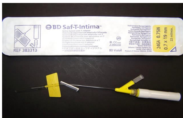
BD Saf-T-Intima™ IV catheter Safety System

Note: BD saf-T intima's™ are not approved for sub cut use by the Therapeutic Goods Administration. The use of BD saf-T intima™ is based on best practise evidence. To date there have been no adverse events relating to the use of BD saf-T intima™ for sub cut administration.