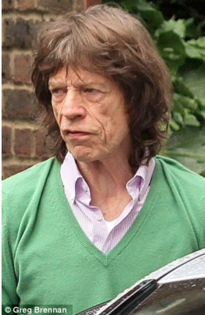
Mick Jagger, 75