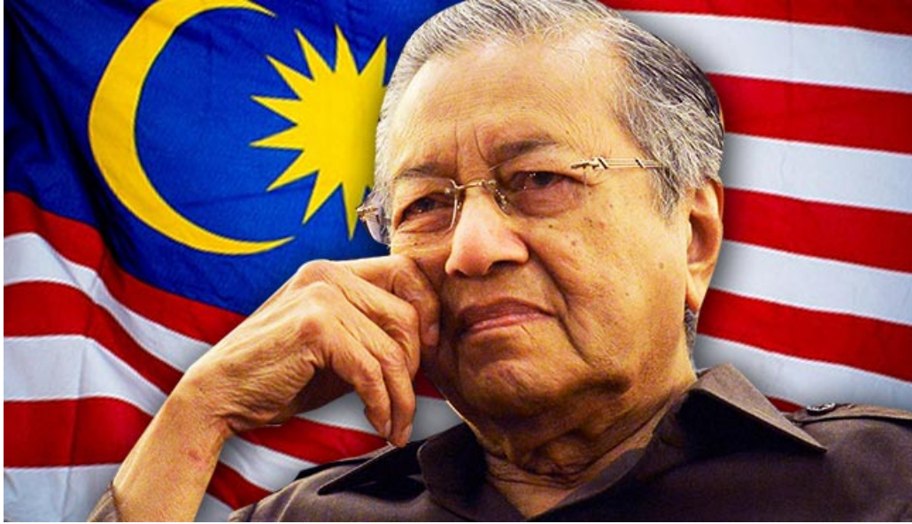
Robert Mugabe 94