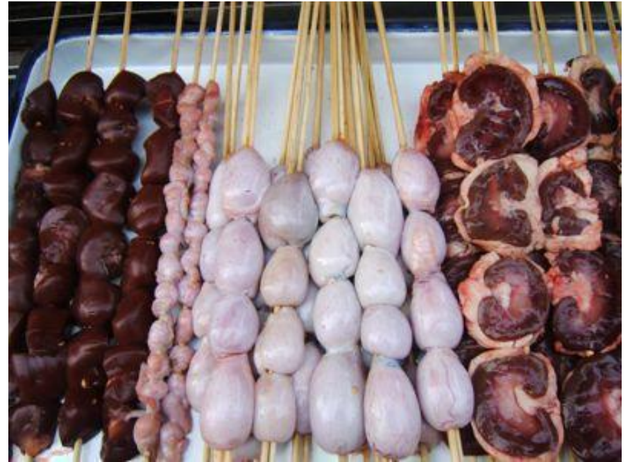
Goat testicles at Beijing market