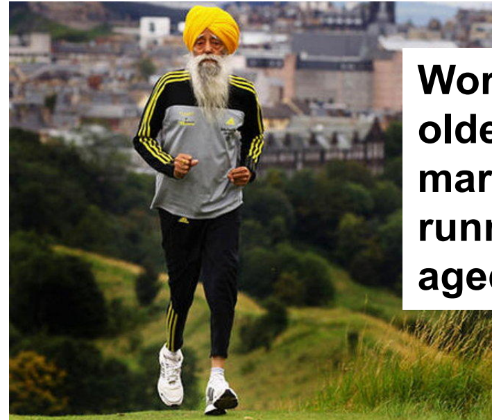
World's oldest marathon runner, aged 104