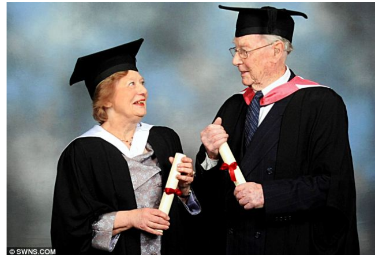
Master's degree, 94yo