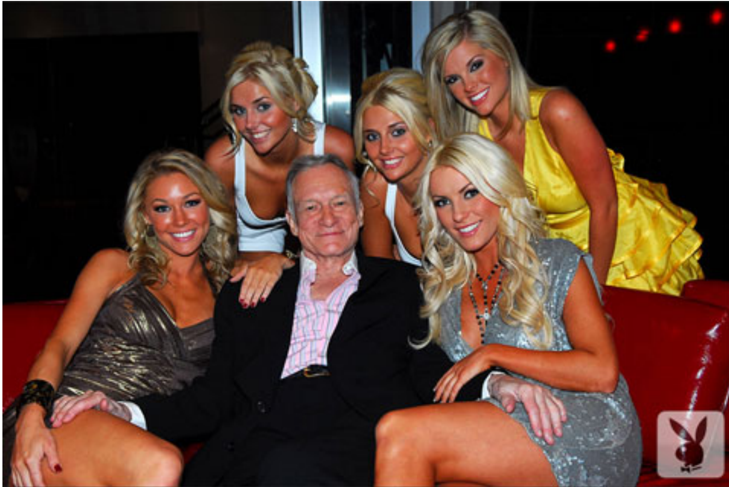
Hugh Hefner, 83