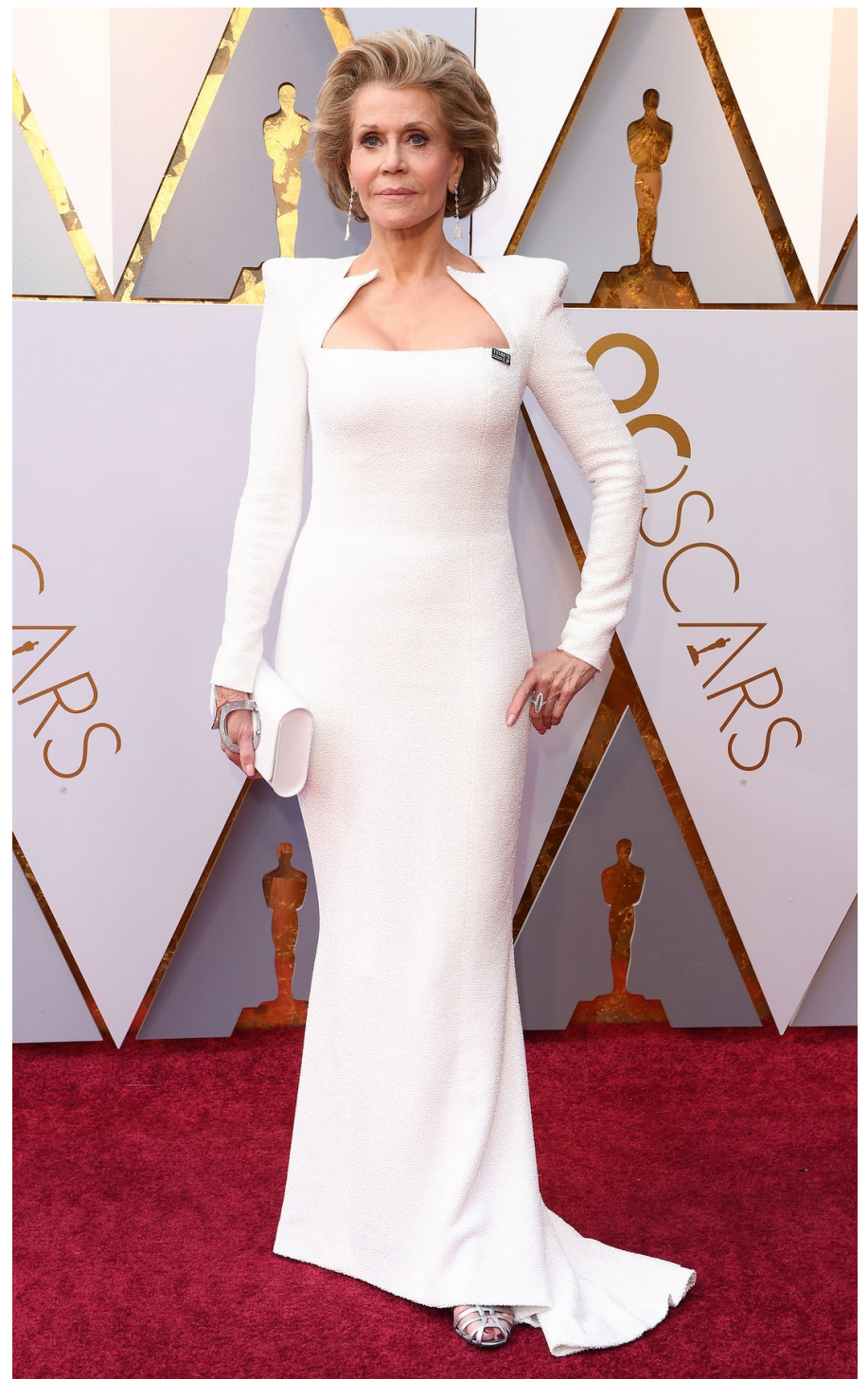
Jane Fonda, 80 2018 Oscars