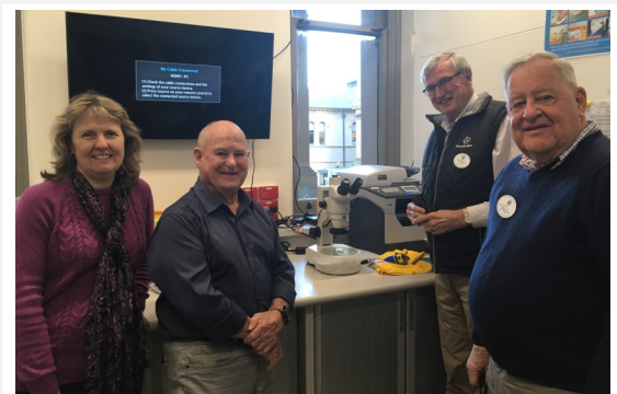
Members of the Lions Save Sight Foundation unveiling the new light microscope

The microscope has been set up in the eye tissue laboratory and will be used to assess tissue after dissection of the cornea to look for evidence of cancer, haemorrhages and retinal disease.