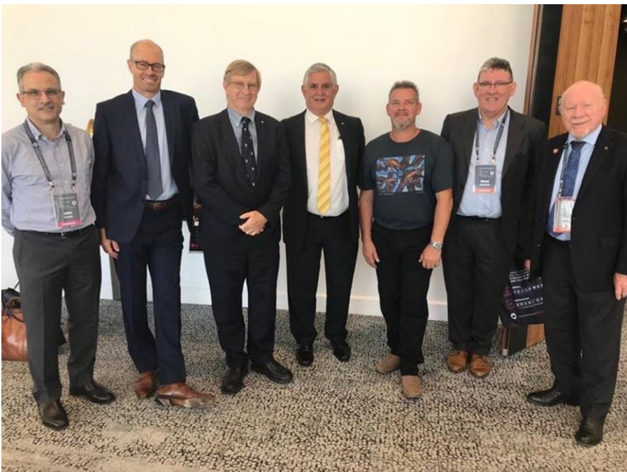
The Hon Ken Wyatt AM, MP and other speakers at the 2019 Connecting Donation and Transplantation Conference