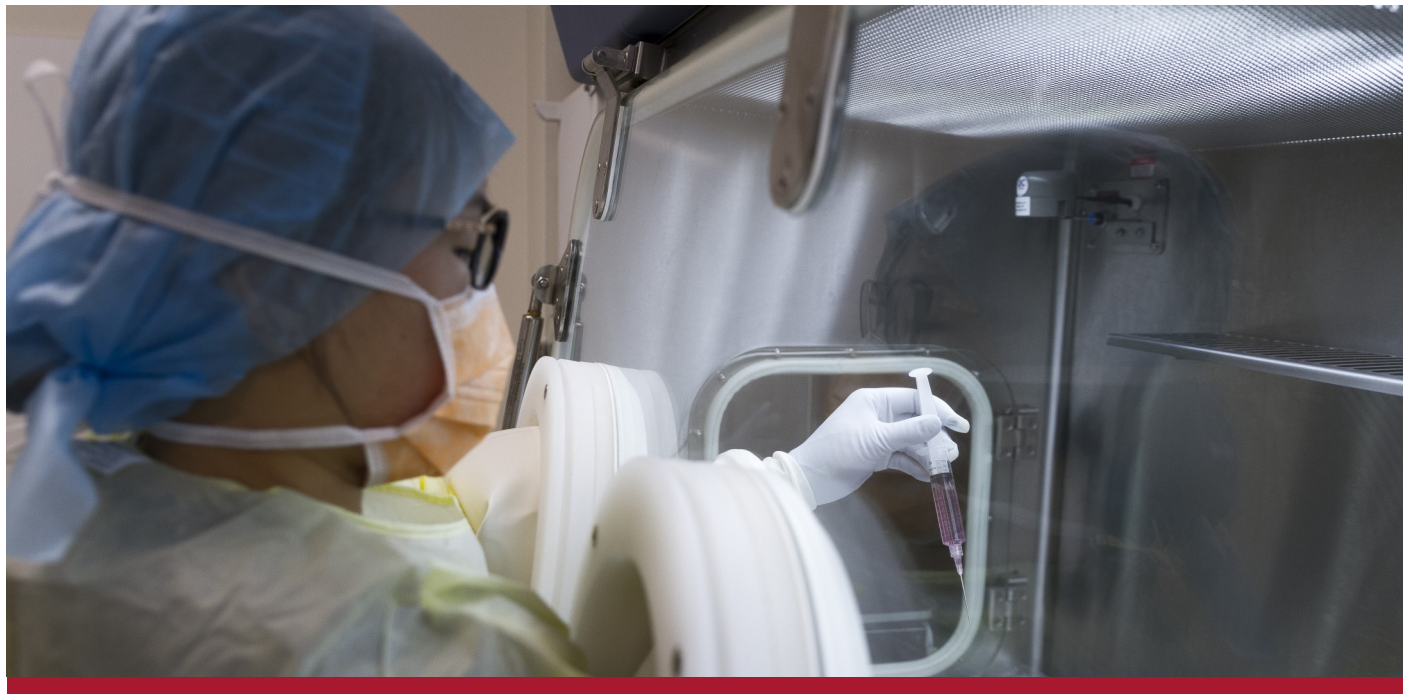
Welcome to the November edition of the NSW Tissue Bank Newsletter