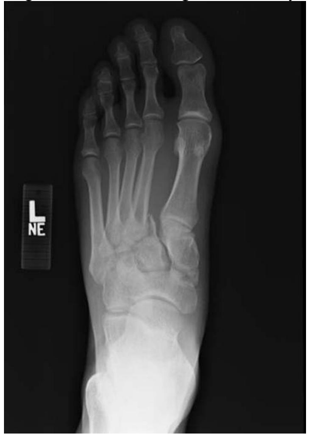
26.Describe and interpret the following Xray?

25.Discribe and interpret the following Xray of a man who was running away from police , drug affected and unable to give much history? Swollen and painful foot.