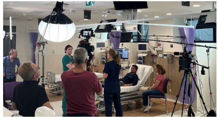
Photo: ASAP training video filming at POWH ED

The education team have been working hard to put together a suite of training videos to assist clinicians in mastering the ASAP tool. Filmed in the Prince of Wales Emergency Department, the videos are now in post production and will be due for release in early 2024.