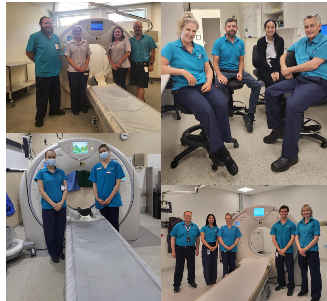
Photo clockwise from top left: Medical imaging teams Moruya, SERH, Goulburn, Cooma

Every nurse, doctor, nurse unit manager, nurse educator, radiographer, allied health and ward support officer in all key departments across SNWSLHD Telestroke sites deserve to be recognised for their dedication and hard-work in improving the care provided to stroke patients.