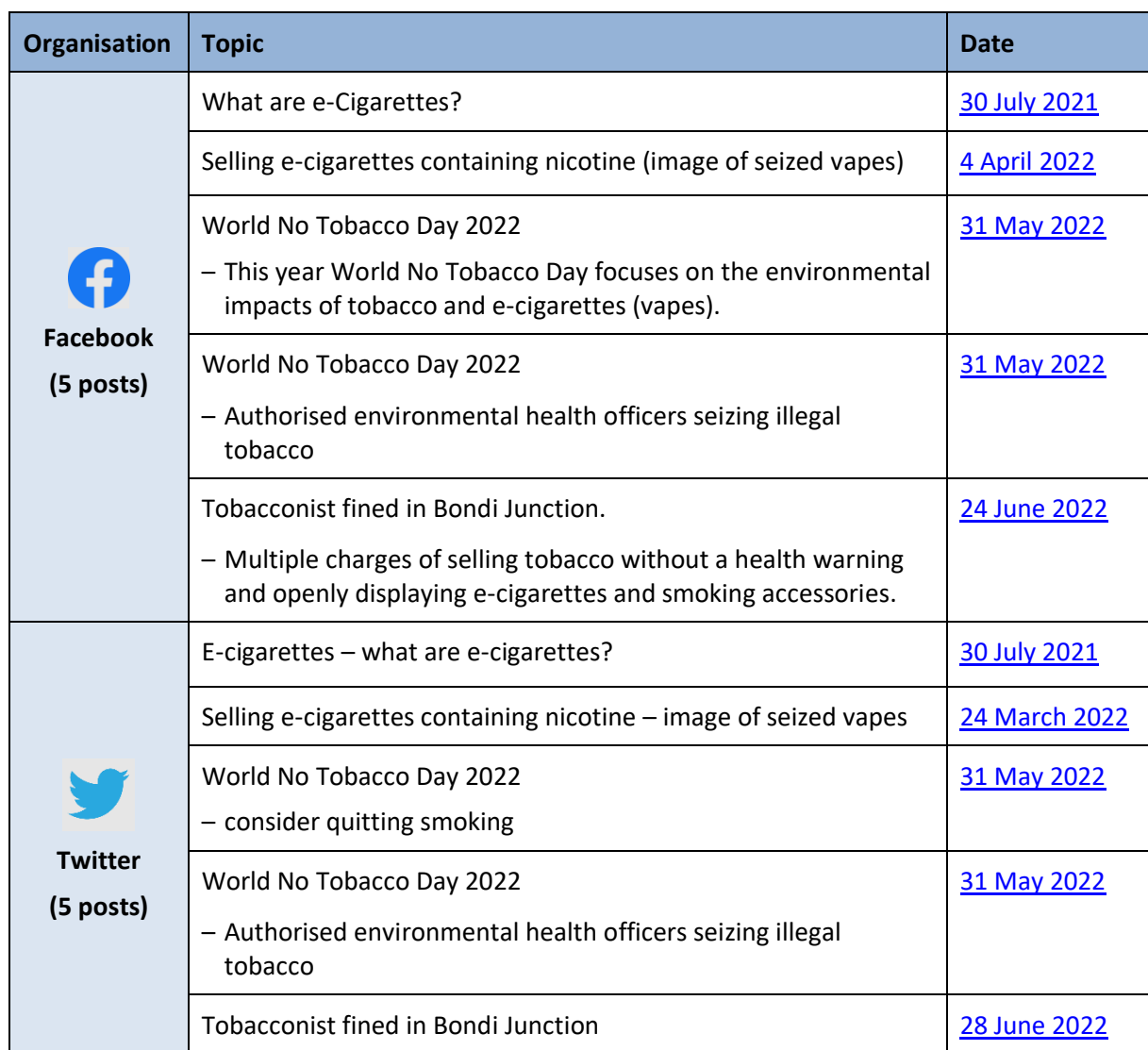
Table 8. Social and media releases during 2021 and 2022 financial year