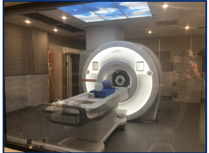
Above: our new 3T MRI machine being tested by Siemens as part of operational commissioning

We expect to begin welcoming patients to commence use of the new MRI services in mid-2023.