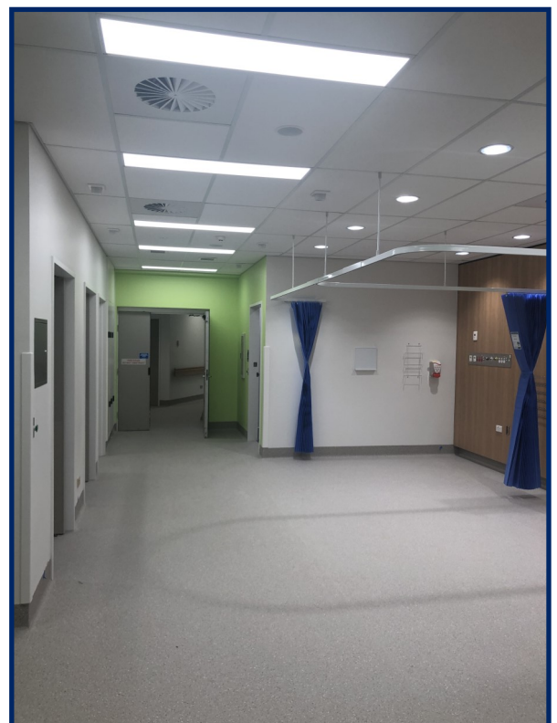
Left: MRI machine is crane lifted in to the site