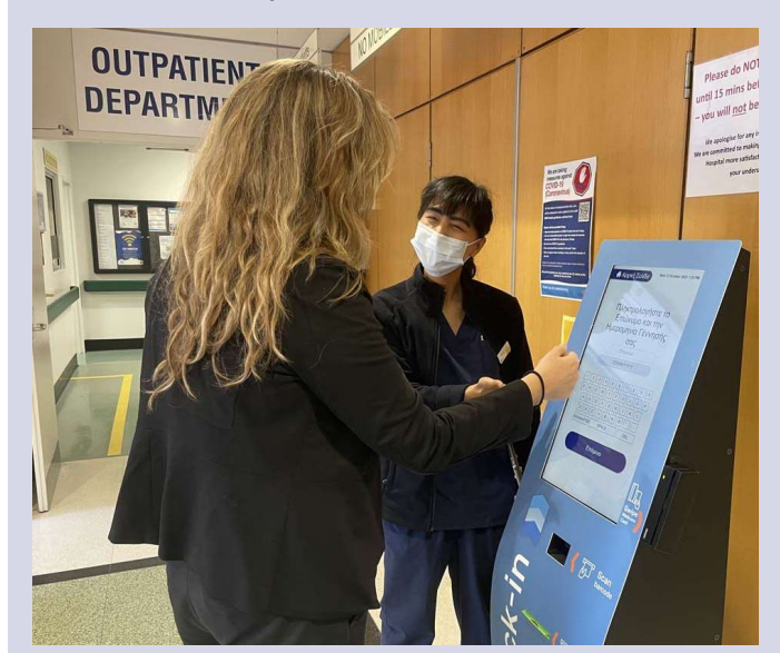
Self-service kiosk at the Outpatients Department